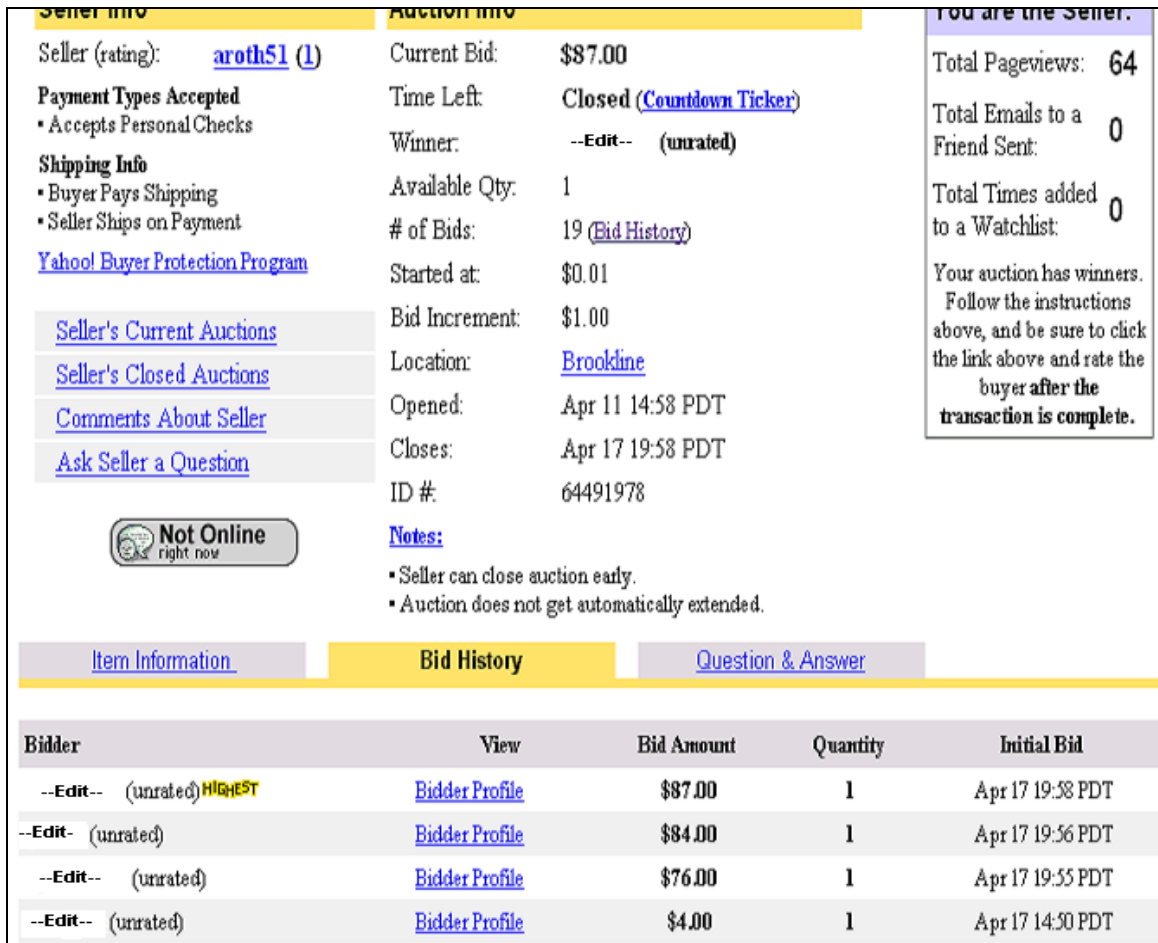
Figure 2: The Bid History